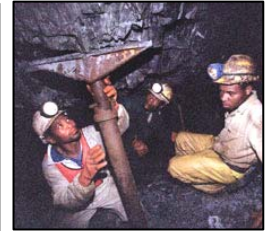
gold miners, S. Africa