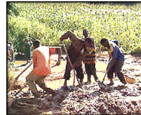
coltan miners, Congo